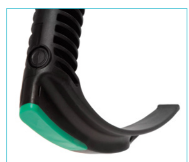
Airway Management • Airway Accessories